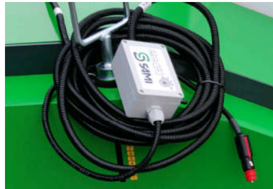
Remote in cab