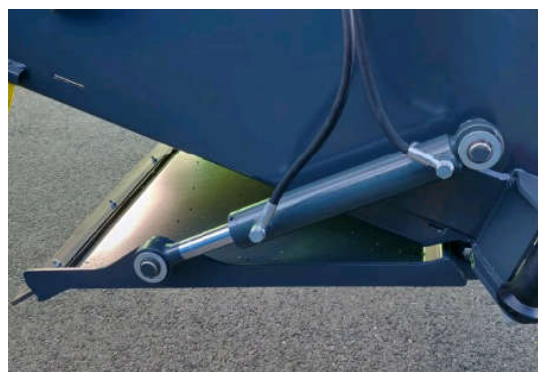
Emptying the bucket

The bucket has built so that all the dust stays I there as long as emptying of the bucket is needed. The cylinders that open the bucket's shutter below are placed behind the cover outside the bucket, so they work in not so dusty environment.