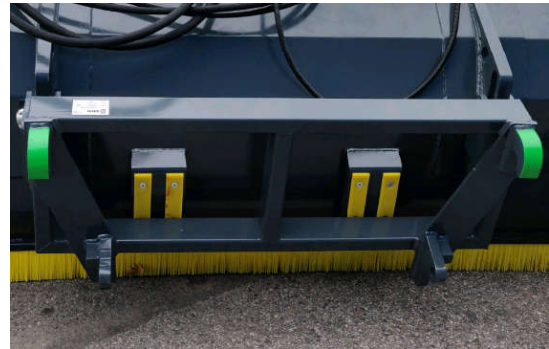
EURO floating frame