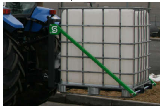
Additional water tank with holder for sweepers